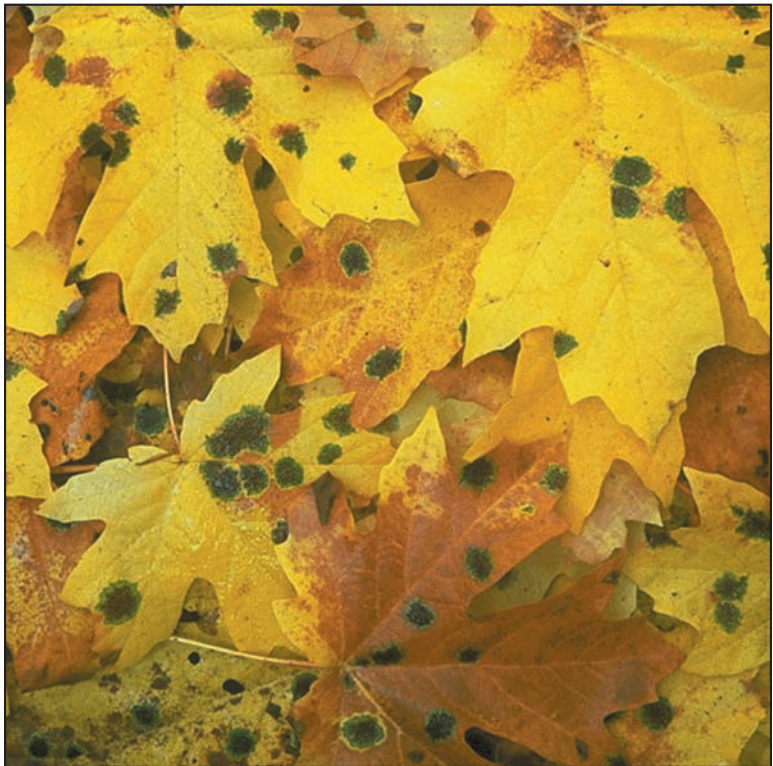
Mold growing on fallen leaves.

This document is available on the Environmental Protection Agency, Indoor Environments Division website at: www.epa.gov/mold